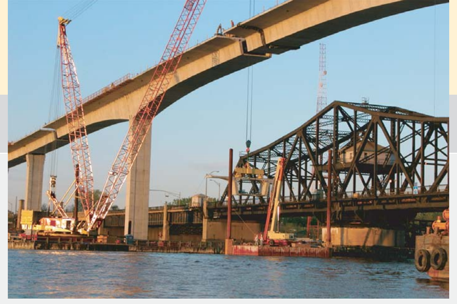
Design/Build New Route 35 (Victory Bridge) over Raritan River, Rahway, NJ Owner: NJ Dept. of Transportation Construction Supervision