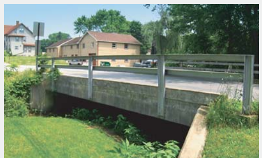
Design/Build Irish Creek Road Bridge, Centerport, PA Owner: Pennsylvania Dept. of Transportation Superstructure Replacement and Roadway Design Traffic Control, Right-of-Way and Permitting