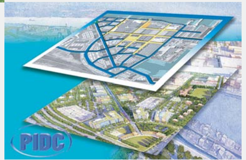
Design/Bid/Build The Philadelphia Navy Yard Infrastructure Improvements, Philadelphia, PA Owner: Philadelphia Industrial Development Corporation Civil Engineering, Landscape Architecture, Construction Inspection, and Owner's Representative Services