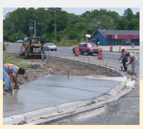
Design/Bid/Build Sidewalk & ADA Ramps, NY City Owner: NYC Dept. of Design & Construction Construction Engineering