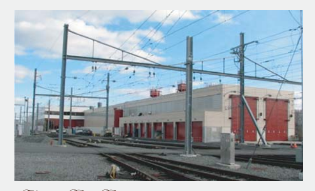
Design / Bid / Build Morrisville Train Storage Yard (Phase 2), Morrisville, PA Owner: NJ Transit Corporation Site / Civil and Geotechnical Engineering