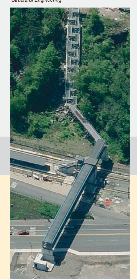
Design/Build Port Imperial Station Pedestrian Bridge, Weehawken, NJ Owner: NJ Transit Corporation Structural Engineering