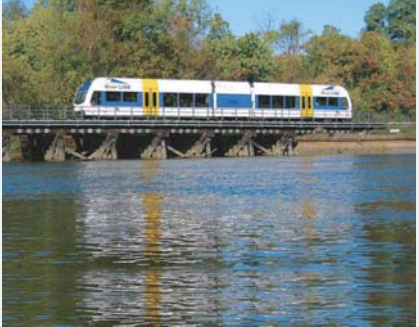
Design/Build Southern NJ Light Rail System, Camden, NJ Owner: NJ Transit Corporation Civil and Structural Engineering

Design/Build gives today's clients a seamless cost effective functional product from one accountable source. To become a successful partner in any design/build project, the designer must understand that, instead of projects budget being the result or afterthought of the project's design, with the design/build process the design is derived as a result of the budget. Since our inception in 1991, KSE has been part of many successful public sector design/build projects. KSE's work begins on a design/build project before the final contract is executed. Critical items such as permits are identified and wheels are put in to motion to secure them as early as possible. Our goal in the design/build process is to reduce construction cost and be responsive to demanding field schedule. Our engineering team responds quickly to any changes due to varied field conditions. Our design process entails the development of optimal and most economical construction methods, materials studies and related activities. We work closely with the contractor, owner agency, and community groups to ensure that specific programmatic requirements are complimented by innovative, efficient and cost effective designs.